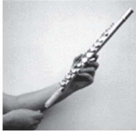
Figure 3 Swabbing the Body of the Flute

Note. From Cosmo Music Instrument Care Tips . Retrieved February 20, 2008, from http://www.cosmomusic.ca/frame/mfrepair.htm