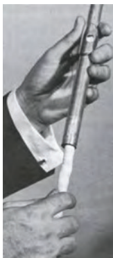
Figure 2 Swabbing the Head Joint of the Flute

The cleaning rod must be inserted gently into the head joint to avoid moving the end plug. The end plug tunes the instrument.